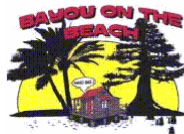
Illustration: Drawing or design which also includes word(s)/letter(s)/number(s)

Mark: BAYOU ON THE BEACH WHO DAT? Status: Registered Status Date: 05 August 2008 Registration Number: 3481972 Registration Date: 05 August 2008 Publication Date: 11 March 2008 Type: Trademark Serial Number: 77-301083 Filing Date: 10 October 2007 Register: PRINCIPAL Transaction Date: 05 August 2008 Standard Character Claim: NO