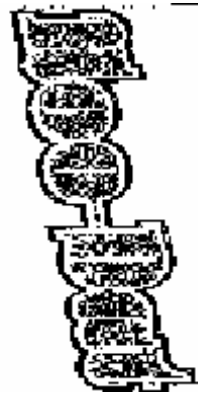
Illustration: Drawing with word(s)/letter(s)/number(s) in Stylized form

Mark: HOODAT Status: Abandoned - Failure to Respond Status Date: 08 August 2002 Type: Trademark Serial Number: 78-055954 Filing Date: 30 March 2001 Register: PRINCIPAL Transaction Date: 27 February 2006 Standard Character Claim: NO