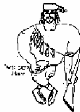
Illustration: Drawing or design which also includes word(s)/letter(s)/number(s)

Mark: WHO DAT? BREW Status: Abandoned - Failure to Respond Status Date: 02 July 1993 Type: Trademark Serial Number: 74-298595 Filing Date: 22 July 1992 Register: PRINCIPAL Transaction Date: 24 October 2004 Standard Character Claim: NO