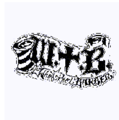
Illustration: Drawing or design which also includes word(s)/letter(s)/number(s)

Mark: W.T.B. WHO'S THAT BARBER Status: Abandoned - Failure to Respond Status Date: 15 December 2009 Type: Trademark Serial Number: 77-674531 Filing Date: 20 February 2009 Register: PRINCIPAL Transaction Date: 15 December 2009 Standard Character Claim: NO