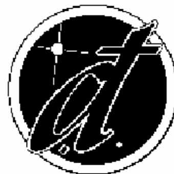
Illustration: Drawing or design which also includes word(s)/letter(s)/number(s)

Mark: DAT Status: Abandoned - No Statement of Use filed Status Date: 27 September 2002 Publication Date: 01 January 2002 Type: Trademark Serial Number: 76-060186 Filing Date: 30 May 2000 Register: PRINCIPAL Transaction Date: 23 December 2005 Standard Character Claim: NO