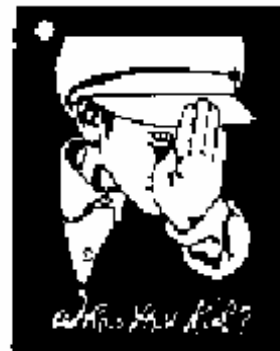
Illustration: Drawing or design which also includes word(s)/letter(s)/number(s)

Mark: WHO'S THAT KID Status: Abandoned - Failure to Respond Status Date: 08 July 1993 Type: Trademark Serial Number: 74-146298 Filing Date: 11 March 1991 Register: PRINCIPAL Transaction Date: 24 October 2004 Standard Character Claim: NO