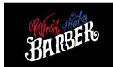
Illustration: Drawing or design which also includes word(s)/letter(s)/number(s)

Mark: WHO'S THAT BARBER Status: Notice of Allowance - Issued Status Date: 19 January 2010 Publication Date: 27 October 2009 Type: Trademark Serial Number: 77-755498 Filing Date: 09 June 2009 Register: PRINCIPAL Transaction Date: 19 January 2010 Standard Character Claim: NO