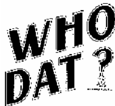
Illustration: Drawing or design which also includes word(s)/letter(s)/number(s)

Mark: WHO DAT? Status: Abandoned - Petition to revive denied Status Date: 05 April 1991 Type: Trademark Serial Number: 73-745956 Filing Date: 15 August 1988 Register: PRINCIPAL Transaction Date: 24 October 2004 Standard Character Claim: NO